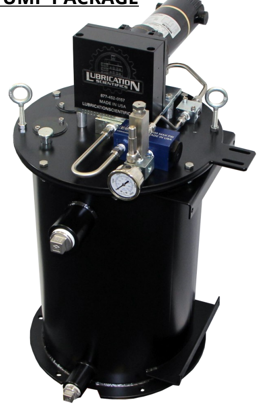
LCPR-60-E24DC W 60LB RESERVOIR