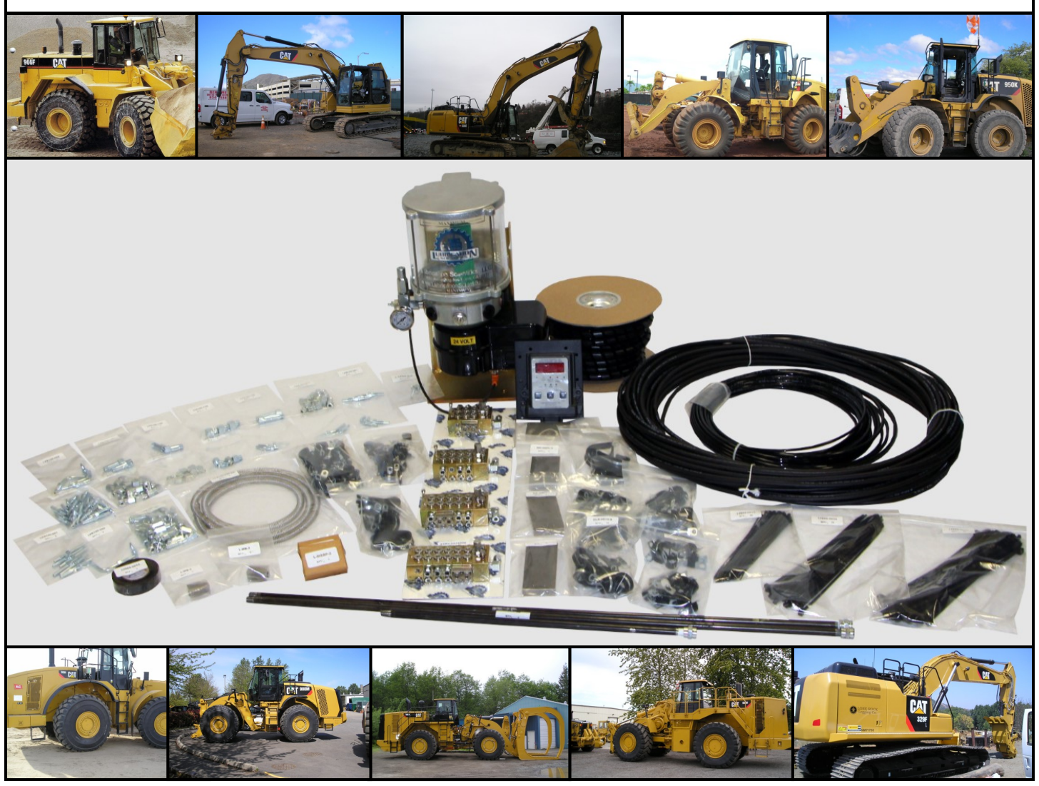
READY FOR IMMEDIATE SHIPMENT