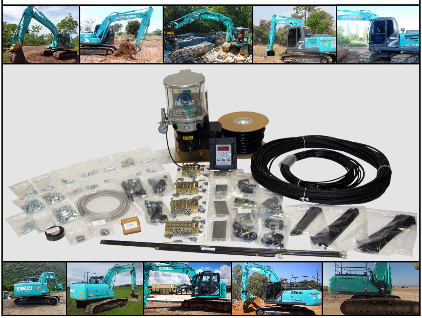
READY FOR IMMEDIATE SHIPMENT