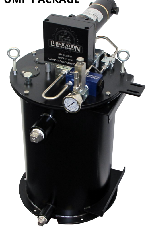
LCPR-60-E24DC W 60LB RESERVOIR