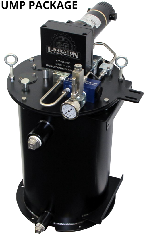
LCPR-60-E24DC W 60LB RESERVOIR