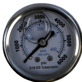
6000 PSI STAINLESS STEEL GAUGE PART NUMBER LCB-15-6K-2 QTY 1