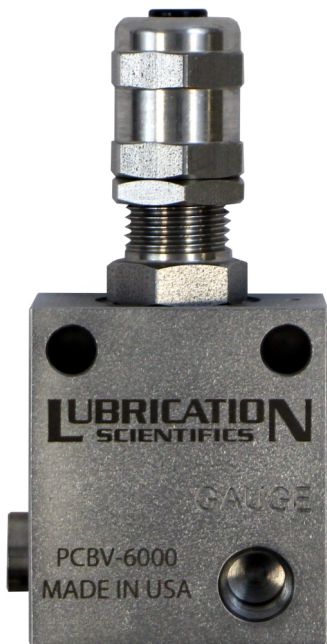
BALANCING VALVE BODY PART# LSRV-003 QTY 1