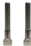
SS CAP SCREWS PART NUMBER 12663-0034 QTY 2